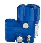
Lid with viewing window