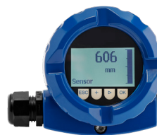
Plug-in display module